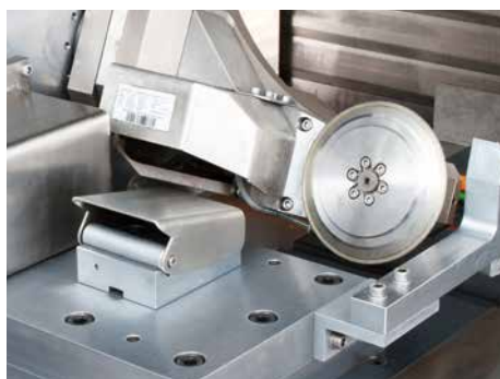
CNC swivel dresser with disc