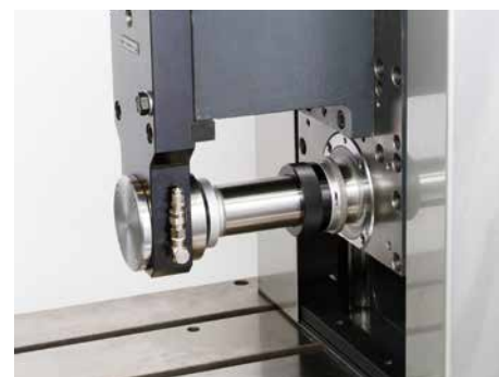
Head mounted diamond roll dressing unit