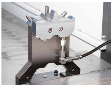
Tilt dressing unit with 3 diamonds